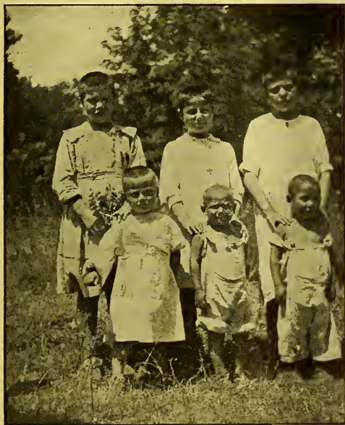
The Children We Help

Of course I thought that was the end of my box, but there is still another chapter. Last winter I received another letter from Boston saying that the insurance on my box, ninety-five cents, was at my disposal. What fun! At last I was to get for the children of Turkey something as a gift from the children of America. I was no longer at Bardizag, however. We had just opened here in Constantinople a hospital for tubercular children. The poor little things have had such a hard time in war days and had so little to eat that they are thin and weak and sick. If you want to know more about that, you must ask your teachers, as my letter is already too long. I go out often to see those boys and girls. They run out of doors and they all crowd around and tell me